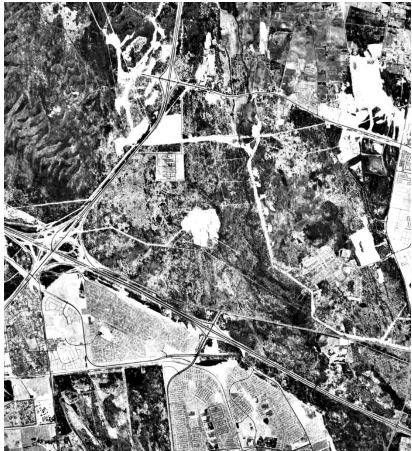
This aerial photograph of the study area was taken in 1988. The illegal sand mine (now a wetland) is clearly visible in the middle of the reserve, the medical waste facility is visible as is urban development to the south.