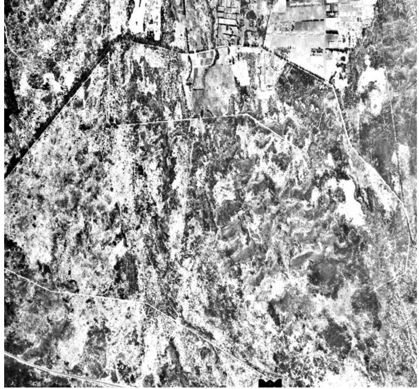
By 1968 when this aerial photograph was taken the study area was largely undeveloped and consisted of semi-vegetated dunes.