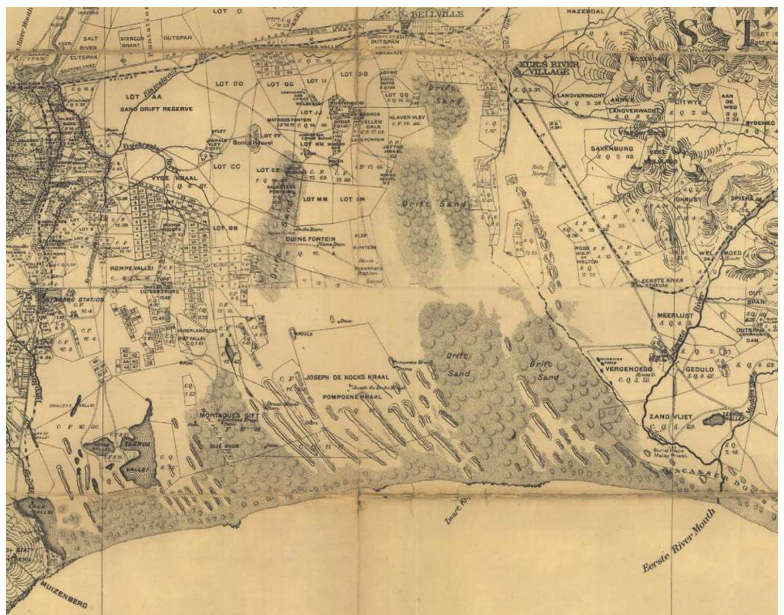
A survey of 1813 indicates the extent of settlement of the Cape Flats at the time (after Cape & Malmesbury 1&13 False Bay and Flats)